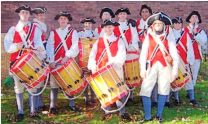
The Drum and Fife Corps poses proudly just prior to its performance at the 2005 Veterans Day Parade.

Reprinted from the Winter 2005-2006 edition of the Beaver Bobcat Battalion JROTC Newsletter