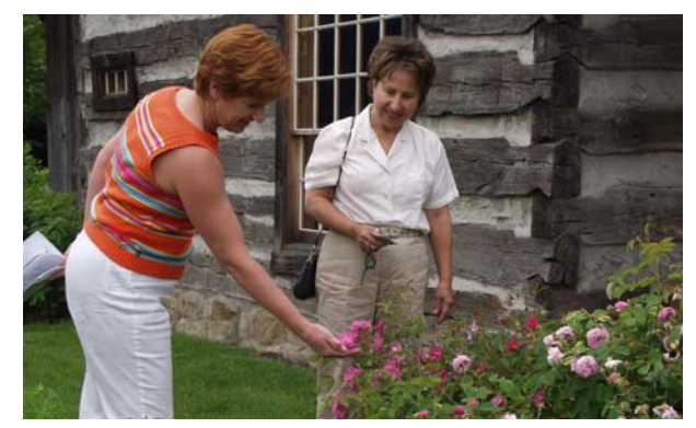
Visitors admire the beautiful pink and red shrub roses

Museum Grounds a Stop on Prestigious 'Open Gardens Day' in Western Pennsylvania