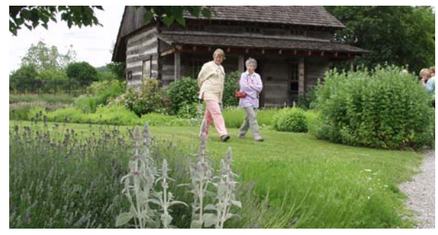
Plantings of lavender, lamb's ear, chamomile and mugwort attract the eye of visitors

Approximately 250 people took part in the Open Gardens Day Tour, which featured 25 gardens in Beaver, New Brighton, Pittsburgh's North Side and Mount Washington.