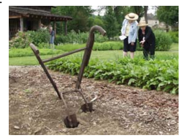
(continued on page 2)

The grounds also feature a grove of young Pennsylvania Smokehouse apple trees, as well as a Beaver County native wildflower garden, which includes Culver's Root, Blue False Indigo and Wild Senna.