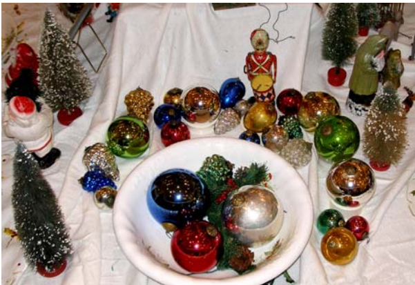
More of the Lewis collection of antique ornaments