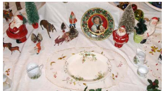
Antique German holiday decorations

As well, more than 400 guests visited the museum and log house on Dec. 4, 2005, as part of the Saints Peter and Paul Church annual Christmas house tour. Most of the visitors had never been to our museum before, and thus the event provided wonderful public exposure. The church has asked if our museum and log house could be included in the Christmas 2006 tour.