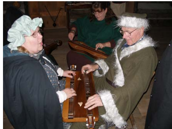
Musical performers sing vintage holiday carols using authentic mandolin instruments