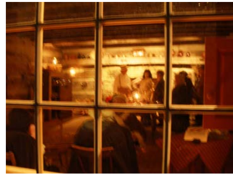
The log house aglow during the Christmas house tour