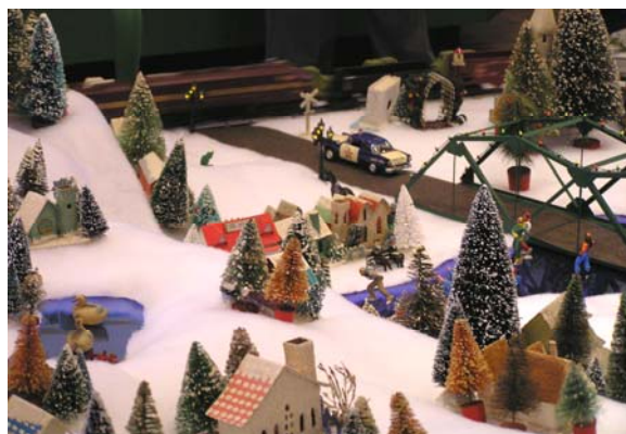
Charming, small town ambience

A Lionel train travels around the village and over a bridge that High painstakingly decorated with tiny, colored lights. In a separate display case is a rarity, a 1933 Lionel-Ives train set including a classic red caboose and a transformer disguised as a station house.