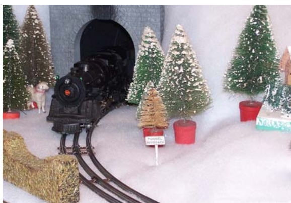
Railroad engine emerges from a tunnel

Charming Holiday Display Helps Museum Set New Attendance Record