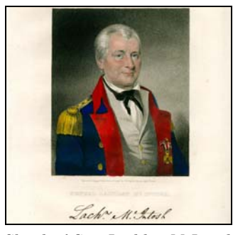
Sketch of Gen. Lachlan McIntosh

Fort McIntosh Site – The site of Fort McIntosh will always be a reminder of what Revolutionary patriots believed in and fought for. We have most of the 80,000 artifacts unearthed during 1970s archaeology as well as significant documentation of the fort and its significance to the development of the nation. Our archive of Gen. Lachlan McIntosh includes engraved portraits and an original letter written from Fort McIntosh.