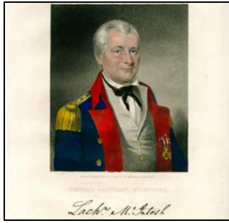
Sketch of Gen. Lachlan McIntosh

Fort McIntosh Site – The site of Fort McIntosh will always be a reminder of what Revolutionary patriots believed in and fought for. We have most of the 80,000 artifacts unearthed during 1970s archaeology as well as significant documentation of the fort and its significance to the development of the nation. Our archive of Gen. Lachlan McIntosh includes engraved portraits and an original letter written from Fort McIntosh.