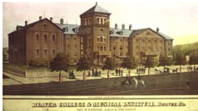
Beaver College and Musical Institute

Beaver College & Musical Institute – One of our larger, more complete collections is related to Beaver College: photos, diplomas, receipts, stock holdings, and records related to staff and various name changes.