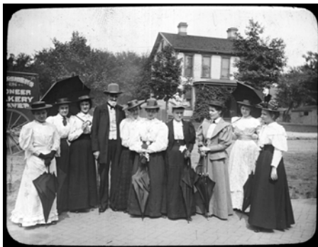
Beaver College faculty